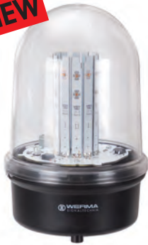
LED Obstruction Light Type B