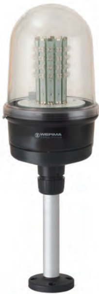
LED Obstruction Light Type A - The adaptor (accessory) allows quick and simple mounting on a tube