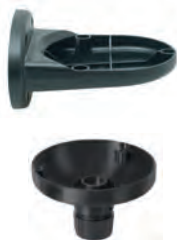
Plastic bracket, adaptor for tube mounting (accessories)